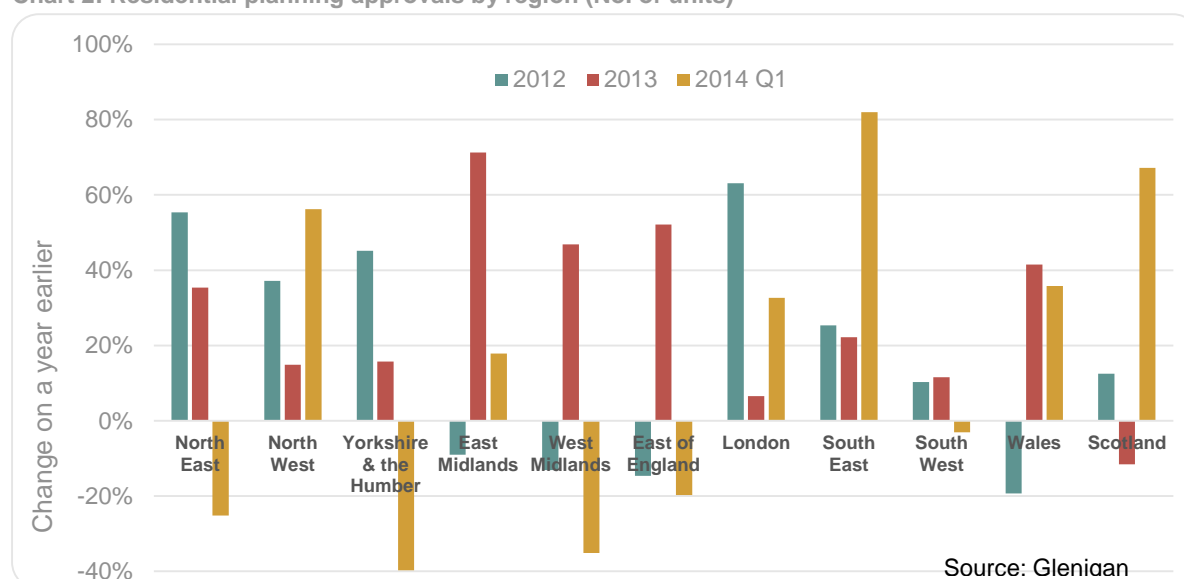
Chart 2: Residential planning approvals by region (No. of units)

Regionally, the number of units approved in the north of England rebounded from the dip seen in the final quarter of 2013, but were still 5% down on a year ago. In contrast although approvals in southern England fell against the strong performance seen in the final quarter of last year, the number of approvals was still up 43% up on a year ago. Approvals in the midlands fell 19% during the quarter to stand 8% down on a year ago. However, the recent weakening follows a 58% rise in approvals last year. Building on last year’s strong growth approvals in Wales were 36% up on a year ago. Approvals in Scotland were sharply higher during the first quarter after last year’s weak performance.