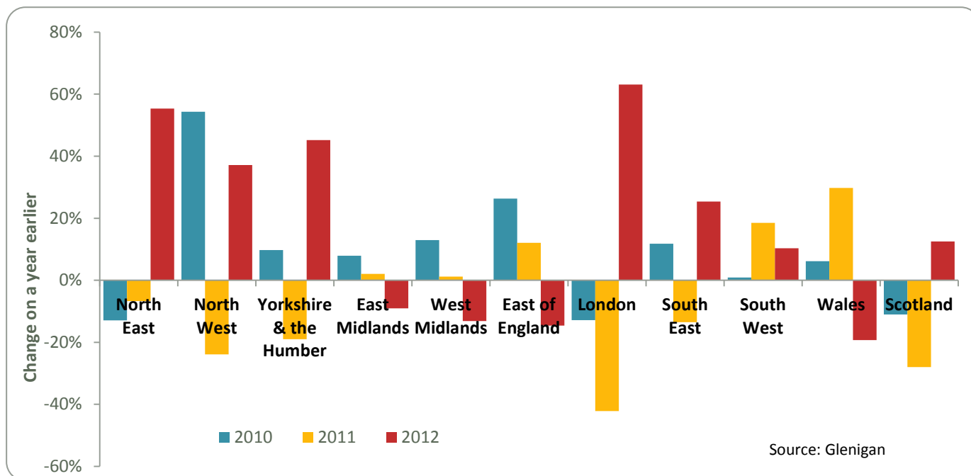
Chart 2: Residential planning approvals by region (No. of units)

Regionally, London and the North of England were the principal growth areas during 2012. Approvals in the Midlands and Wales slipped back during the year, reversing the strengthening in approvals seen during 2010 and 2011. A strengthening in approvals during the closing months of 2012, lifted the annual approvals in Scotland by 13%; providing the first annual increase in six years.