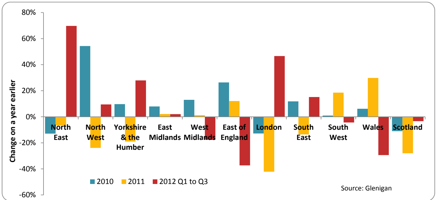
Chart 2: Residential planning approvals by region (No. of units)

Regionally, London and the North of England have been the principal growth areas during the first nine months of 2012. Approvals in the Midlands and Wales have slipped back during the first nine months of 2012, reversing the strengthening in approvals seen during 2010 and 2011. Approvals have remained weak in Scotland.