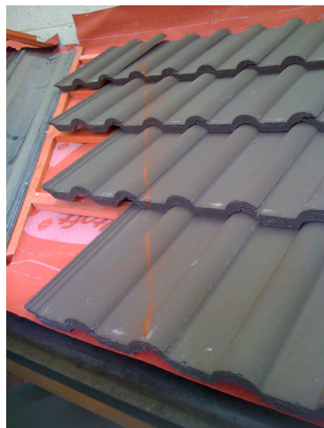
Line struck - two tile widths from desired finishing point in valley line