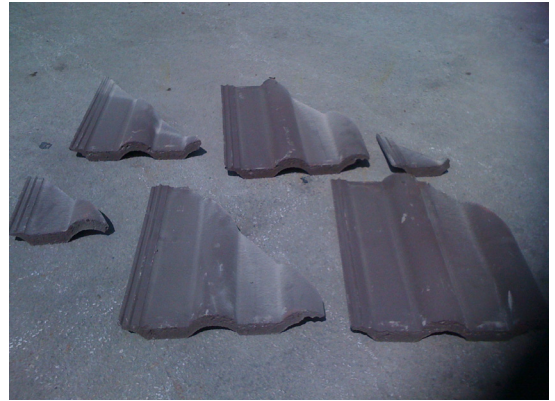
Off-cuts to be re-used on hips