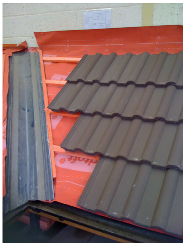
Tiles laid 'staggered' to valley

As with those forming the hip, there is a need to size each tile to the internal angle formed. Tiles should be laid staggered, close to the valley but not into it. Next, measure the covering width of two tiles. Transfer this measurement horizontally from the cut line in the valley; onto the tiles of the top and bottom courses. Longer valleys may need a mid-point to avoid loss of accuracy when striking. The tiles should then be numbered by course with chalk or a pencil, with any nibs likely to kick the tiles removed, and cut off the roof surface on the scaffolding using water suppression and RPE as detailed in ' Controlled Cutting ' below. This should result in a straight valley which is dust and defect free.