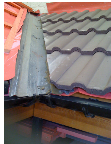
Cut valley is straight

With this method, it is accepted that more time may initially be needed to complete the valley than when cutting in-situ. However there are many advantages too – see ' Benefits ' over the page.