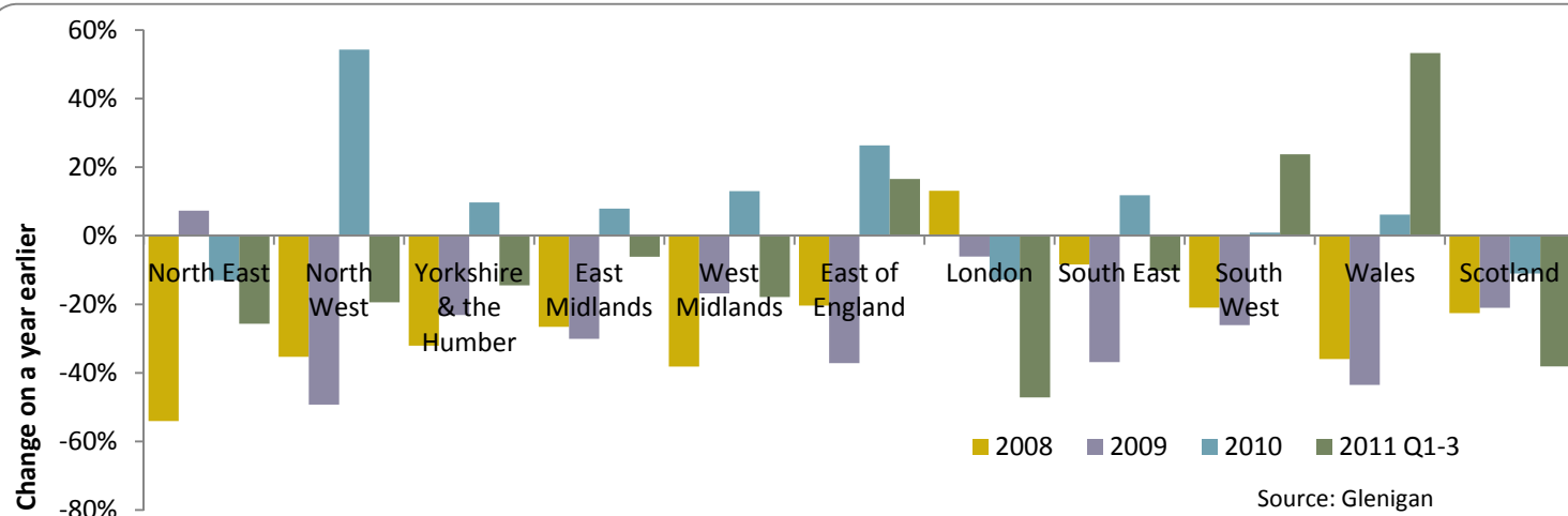
Chart 2: Residential planning approvals by region (No. of units)

Increased approvals in the Midlands and the North of England underpinned the overall rise in residential approvals seen during 2010. Both parts of the country were among those that suffered the steepest decline in planning approvals during 2008 and 2009. However, both of these regions have seen a drop in the number of approvals during the first nine months of 2011, along with a further weakening in approvals in southern England and Scotland. Wales was the one part of Great Britain to enjoy a rise in approvals.