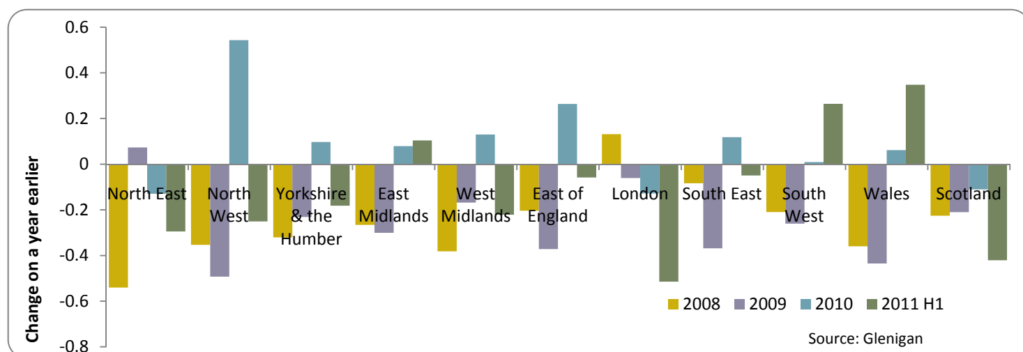
Chart 2: Residential planning approvals by region (No. of units)

Regionally, the overall rise in residential approvals during 2010 was driven by increased approvals in the Midlands and the North of England. However, both of these regions have now seen a drop in the number of approvals over the past six months. Wales is the only part of the UK to see an increase in overall approvals so far this year. Approvals in Southern England were also sharply down on a year ago, although the contraction is distorted by the approval a year ago of a major London development.