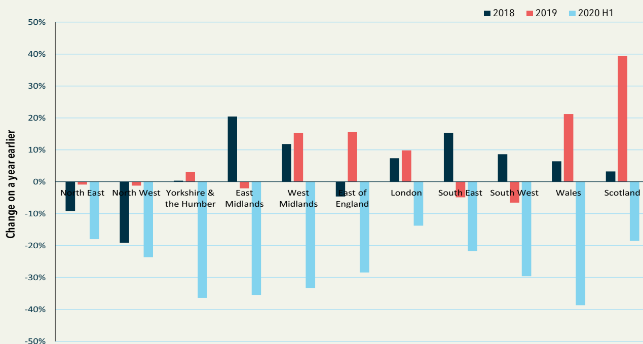
Chart 2: Residential planning approvals by region (No. of units)

N.B. Includes residential projects of all sizes, residential units on non-residential schemes and conversions.