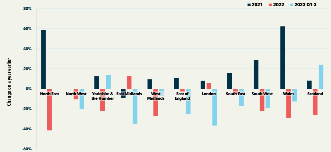
Chart 2: Residential planning approvals by region (No. of units)

N.B. Includes residential projects of all sizes, residential units on non-residential schemes and conversions.