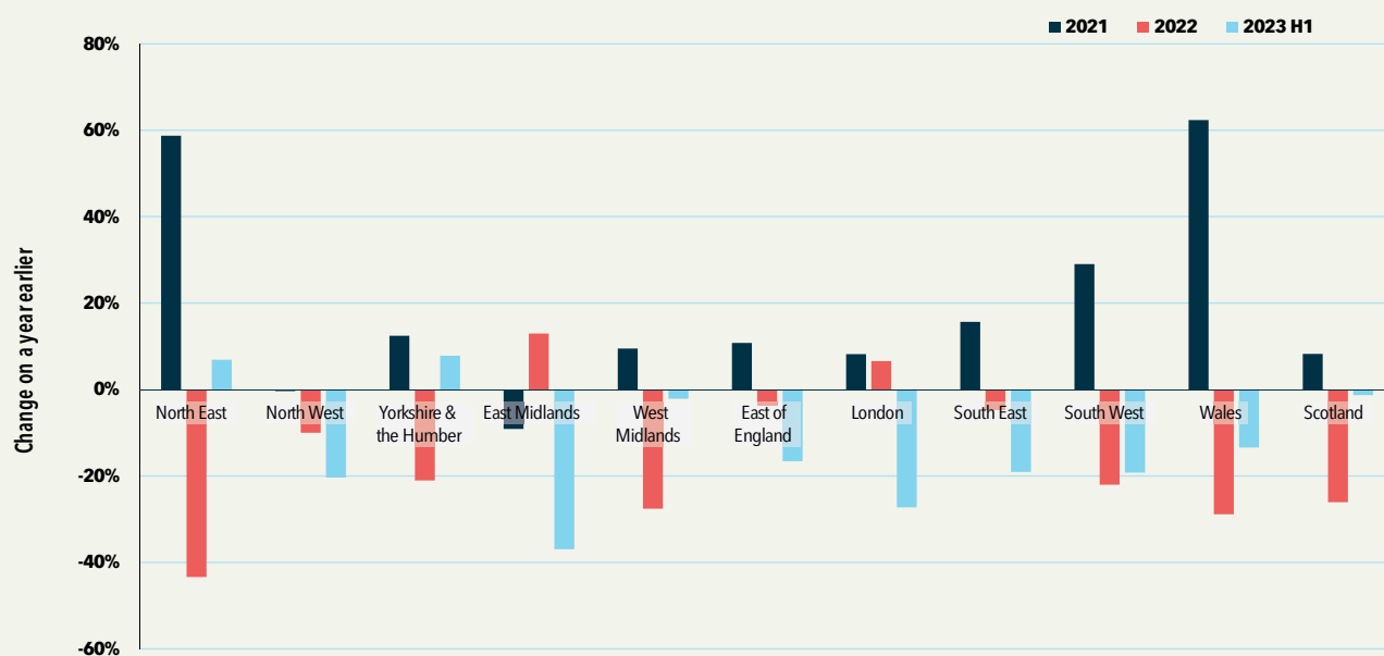
Chart 2: Residential planning approvals by region (No. of units)

N.B. Includes residential projects of all sizes, residential units on non-residential schemes and conversions.