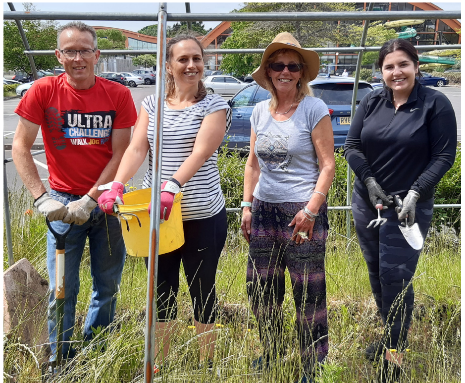
Four McCarthy Stone volunteers working at local charity Access Dorset

Taylor Wimpey have been supporting apprentices over several months, especially as much of the learning draws from digital