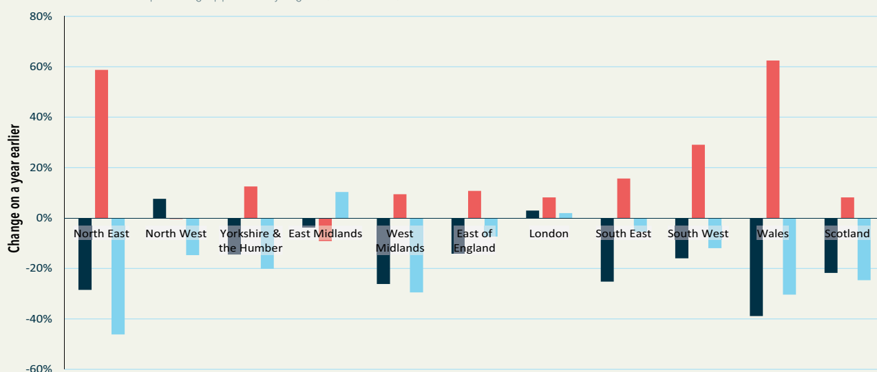
Chart 2: Residential planning approvals by region (No. of units)

N.B. Includes residential projects of all sizes, residential units on non-residential schemes and conversions.