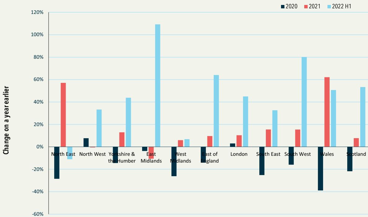
Chart 2: Residential planning approvals by region (No. of units)

Regionally, there was a widespread decline in approvals during the second quarter, with the South West the only region to see a rise of 15% against the preceding three months. London, the East Midlands, North East, and Wales saw the sharpest declines with falls of 60%, 58%, 41% and 43% respectively. Yorkshire & the Humber, West Midlands South East and Scotland also saw double digit declines of 31%, 23%, 11% and 24% respectively against the preceding quarter.