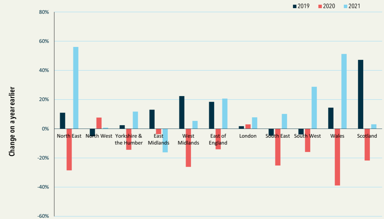
Chart 2: Residential planning approvals by region (No. of units)

There was a mixed performance regionally during the fourth quarter, with the West Midlands, London, South West and Wales seeing sharp increases of 61%, 78%, 21% and 43% respectively against the preceding three months. Approvals were little changed in the South East and the North East. Approvals fell back in the North West, Yorkshire & the Humber, East Midlands and Scotland, with declines of 12%, 27%, 6% and 6% respectively.